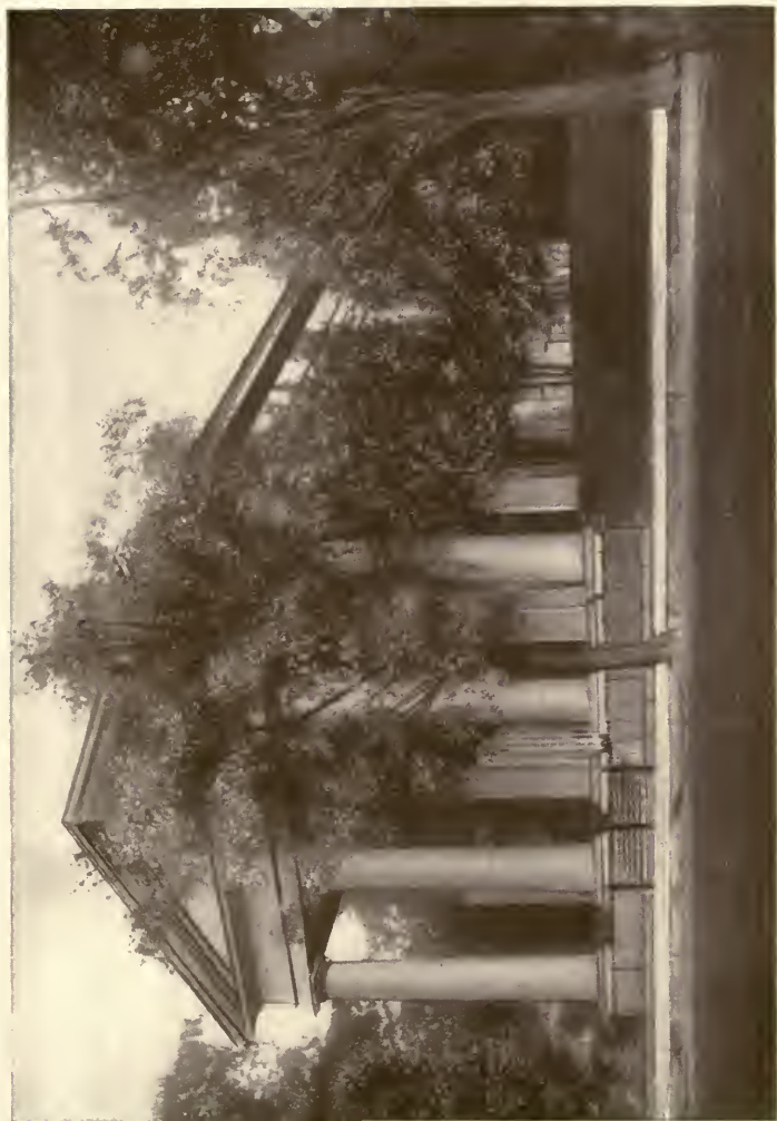
THE OLD BAPTIST CHURCH IN COLUMBIA, S. C.

Here First Met the South Carolina Secession Convention.